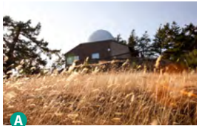
A Pearson College UWC Canada