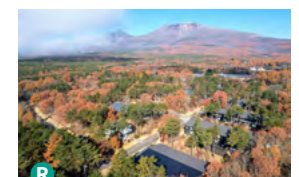
R UWC ISAK Japan Japan