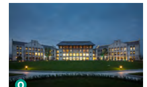
Q UWC Changshu China China