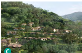
C UWC Costa Rica Costa Rica