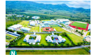
N UWC Thailand Thailand