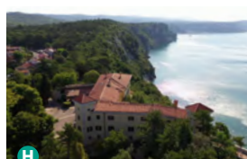
H UWC Adriatic Italy