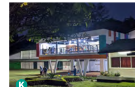
K UWC East Africa Tanzania