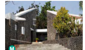
M UWC Mahindra College India