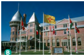
B UWC-USA USA