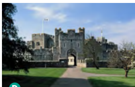
D UWC Atlantic Wales, UK