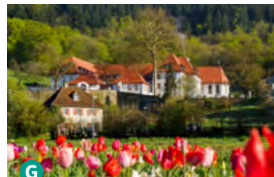
G UWC Robert Bosch College Germany