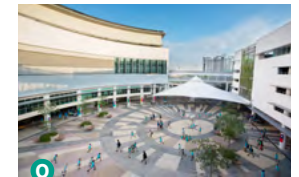
O UWC South East Asia Singapore