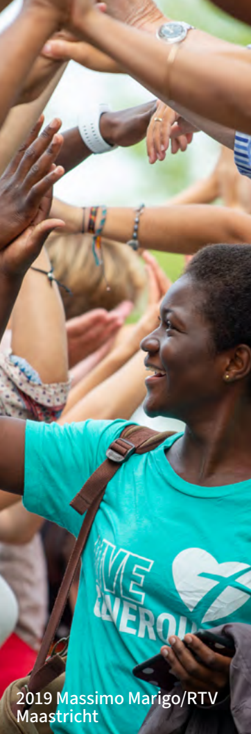
2019 Massimo Marigo/RTV Maastricht