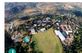
J Waterford Kamhlaba UWC of Southern Africa Eswatini