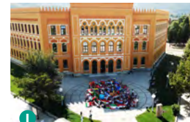
I UWC Mostar Bosnia and Herzegovina