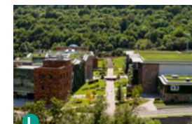
L UWC Dilijan Armenia