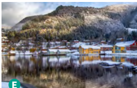
E UWC Red Cross Nordic Norway